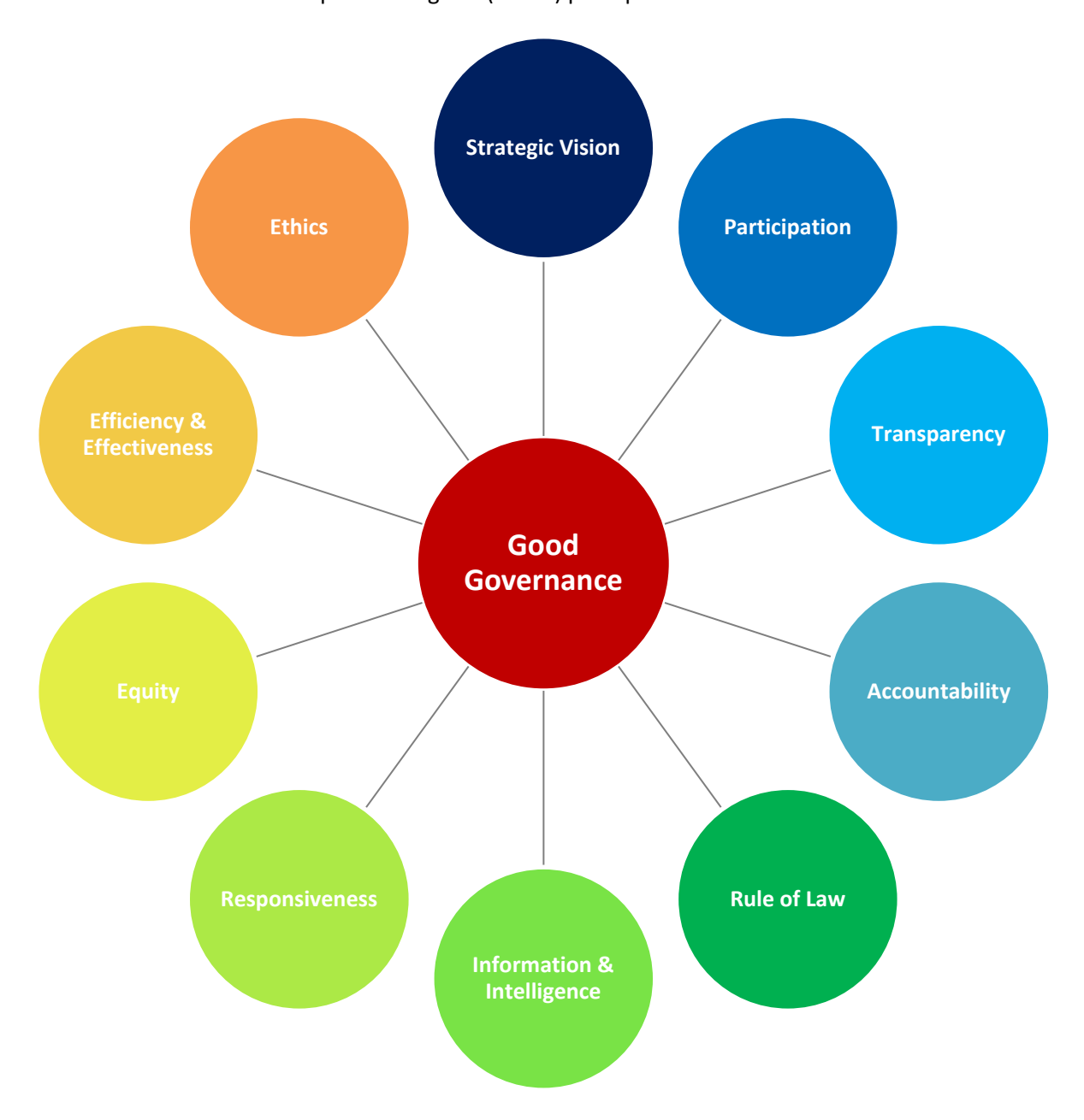
Figure 2. Principles of good governance

The strategy should abide by the ten Good Governance Principles suggested by the WHO that were derived from the United Nations Development Program (UNDP) principles<sup>10</sup>: